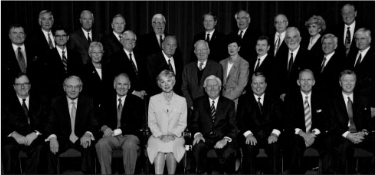
Members of the Canadian Judicial Council at the September 14, 2001, Annual Meeting in Ottawa.